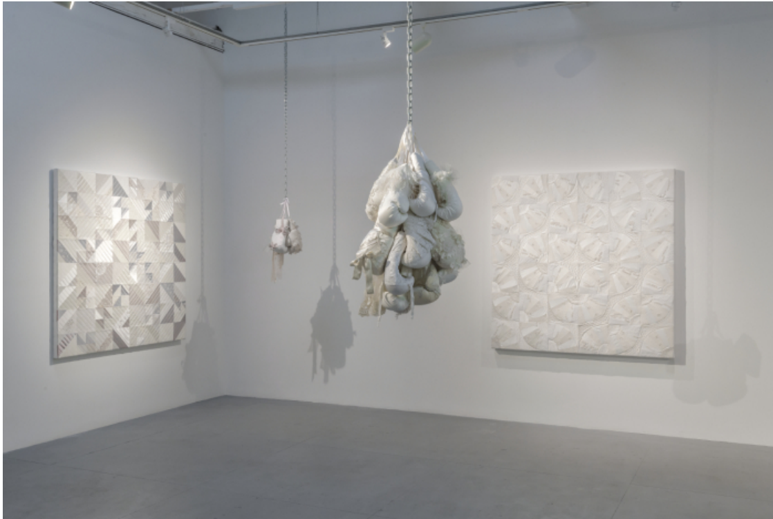
Zoë Buckman, Let Her Rave , Gavlak Gallery

marriage has come to represent, and that feminism has raged against. Buckman pins pieces of the dresses to the boxing gloves and sends them to a wedding dress seamstress to be professionally stitched on. She then assembles the sculptures with the finished gloves back in her studio. In addition to the hanging works there are a collection of “quilts” along the wall, also made out of used wedding dresses. These pieces function between paintings and traditional female fabric work. Wedding dresses are rarely worn after their momentous day; perhaps Buckman’s show is a reuse or recycling of material and memory.