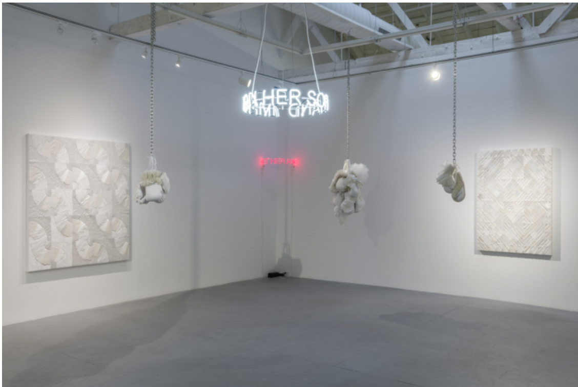
Zoë Buckman, Let Her Rave, Gavlak Gallery