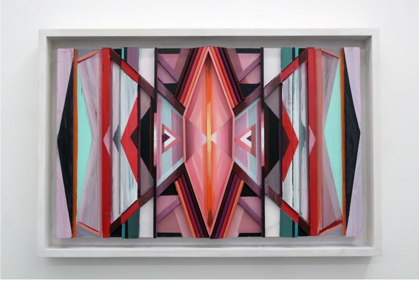
Karen Carson, "Butterfly" (2018)

Carson's geometric paintings, inspired by the land of big sky, mimic rolling hills and valleys.