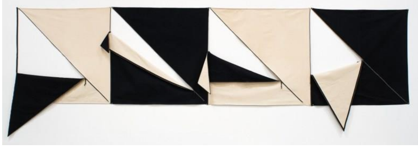
Karen Carson, "Untitled" (1972), unstretched canvas, zippers, 77" x 20' 5" x 6"