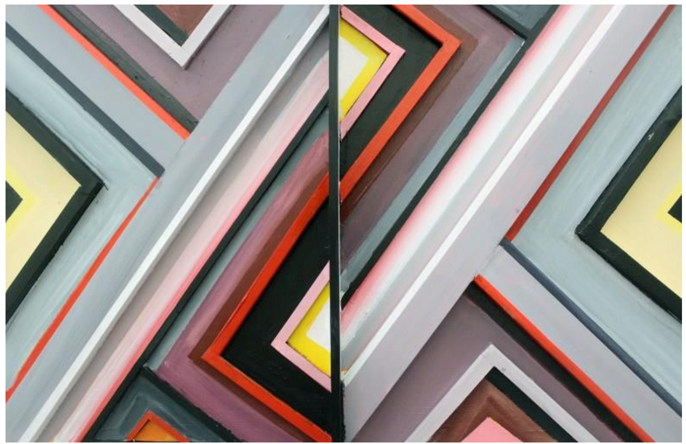
Karen Carson, "Red Fracture" (2020) (detail)

The geometric paintings pop off their three-dimensional surfaces, forming the edges of deep caverns that pull the viewer's gaze into their core, but their symmetrical composition blooms into wide eyes that stare back while you stare in.