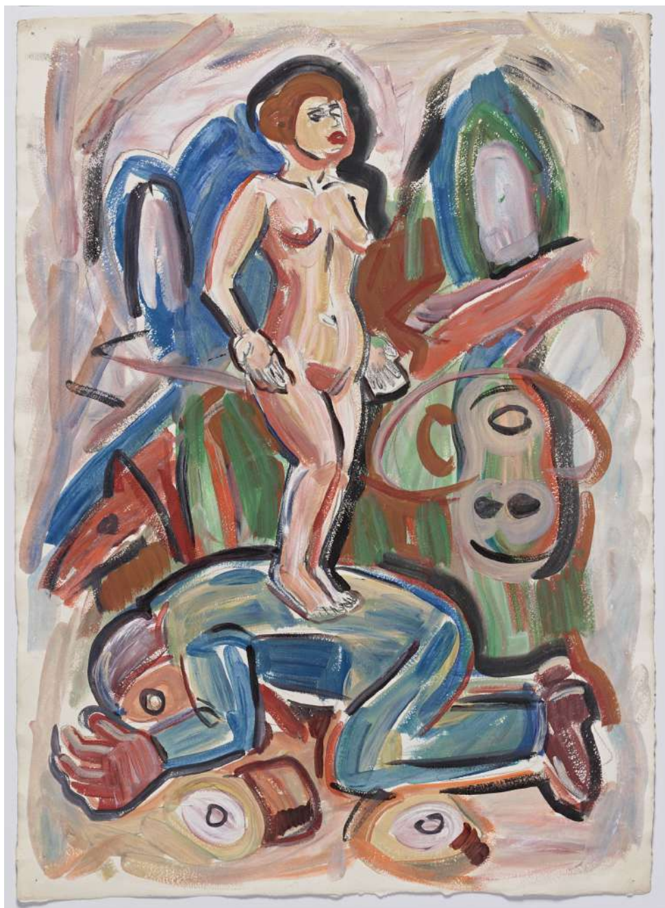
Viola Frey Untitled (Nude Woman on Lying Man) , 1985 Acrylic on paper 31.75 x 22.5 in (80.6 x 57.2 cm) VF0016 $25,000