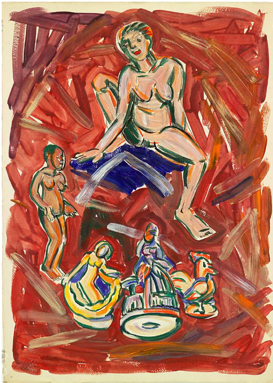
Viola Frey Untitled (Seated Nude Figure, Red Background) , 1985 Acrylic on paper 31 x 22 in (78.7 x 55.9 cm) VF0004 $25,000