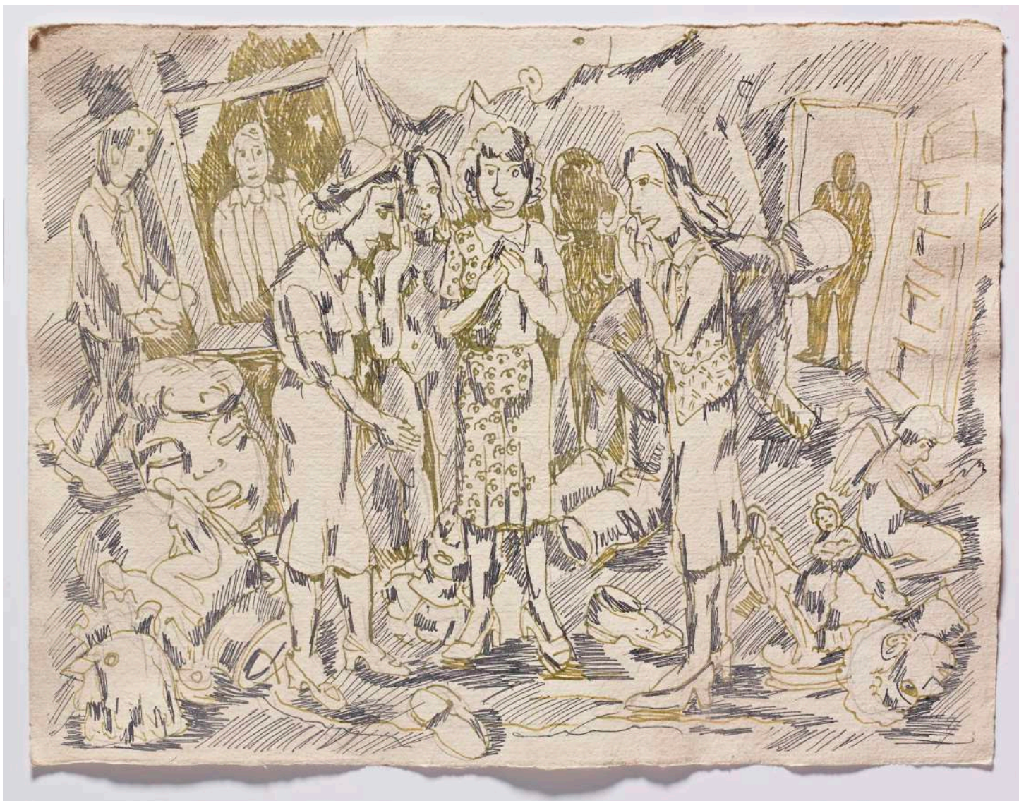
Viola Frey Untitled (Sketch with Three Grandmother Figures) , 1981-84 Graphite, pen, and ink on paper 11.5 x 15 in (29.2 x 38.1 cm) VF0023 $18,000