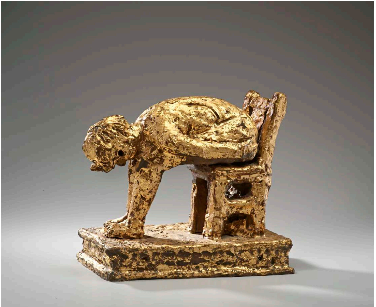
Viola Frey Untitled (Woman Seated and Leaning Over II) , 1985 Bronze and gold leaf 16.25 x 19 x 11.25 in (41.3 x 48.3 x 28.6 cm) VF0019 $35,000