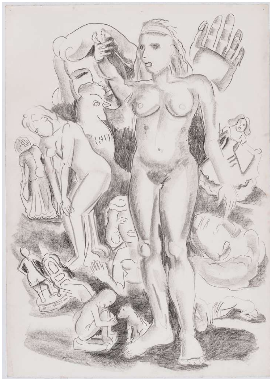
Viola Frey Untitled (Standing Nude Woman) , 1986-87 Graphite and charcoal on paper 42 x 30 in (106.7 x 76.2 cm) VF0022 $30,000