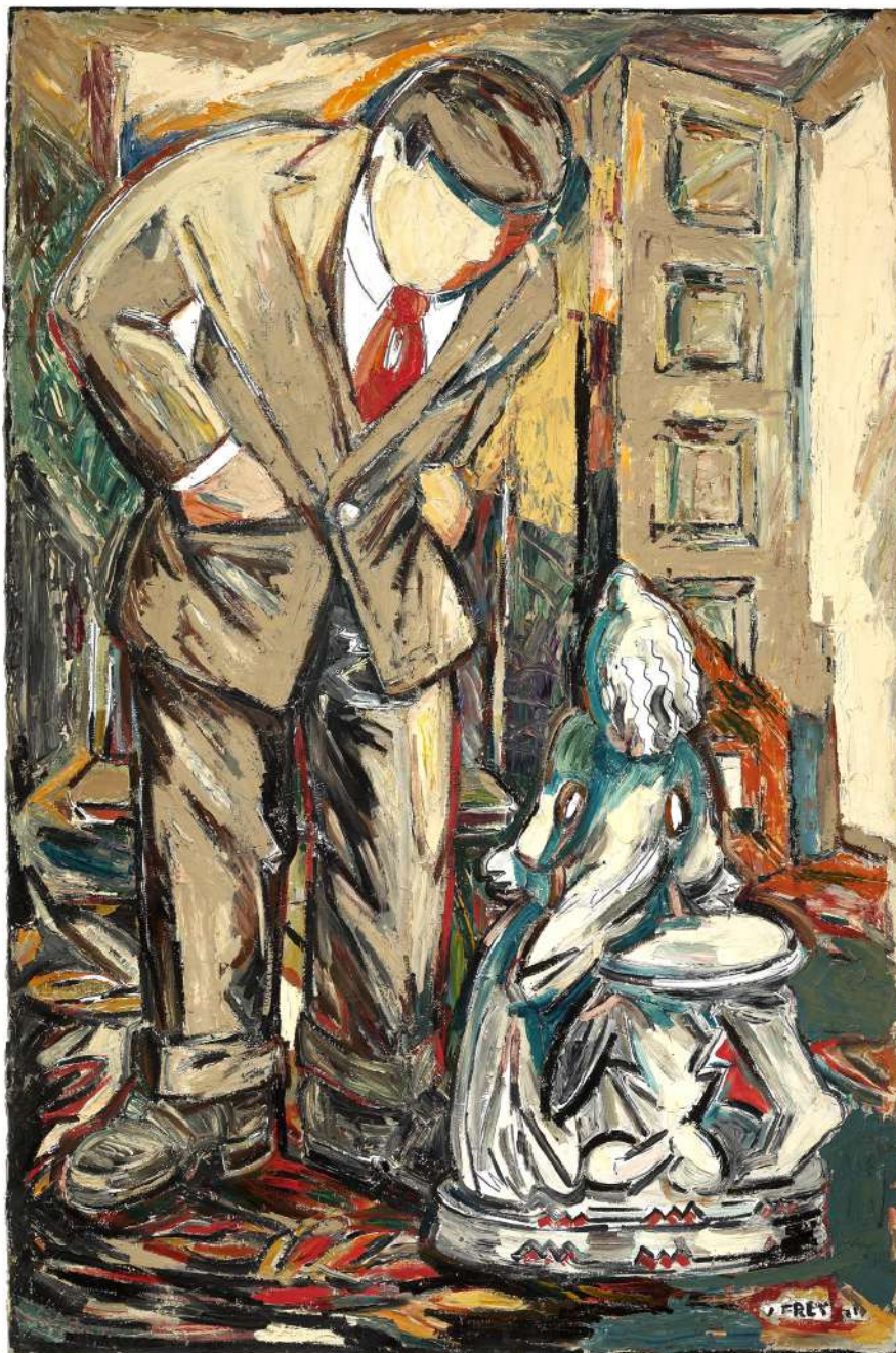
Viola Frey Untitled (Man with Meissen Figurine) , 1982 Oil and acrylic on paper 60 x 40 in (152.4 x 101.6 cm) VF0017 $45,000