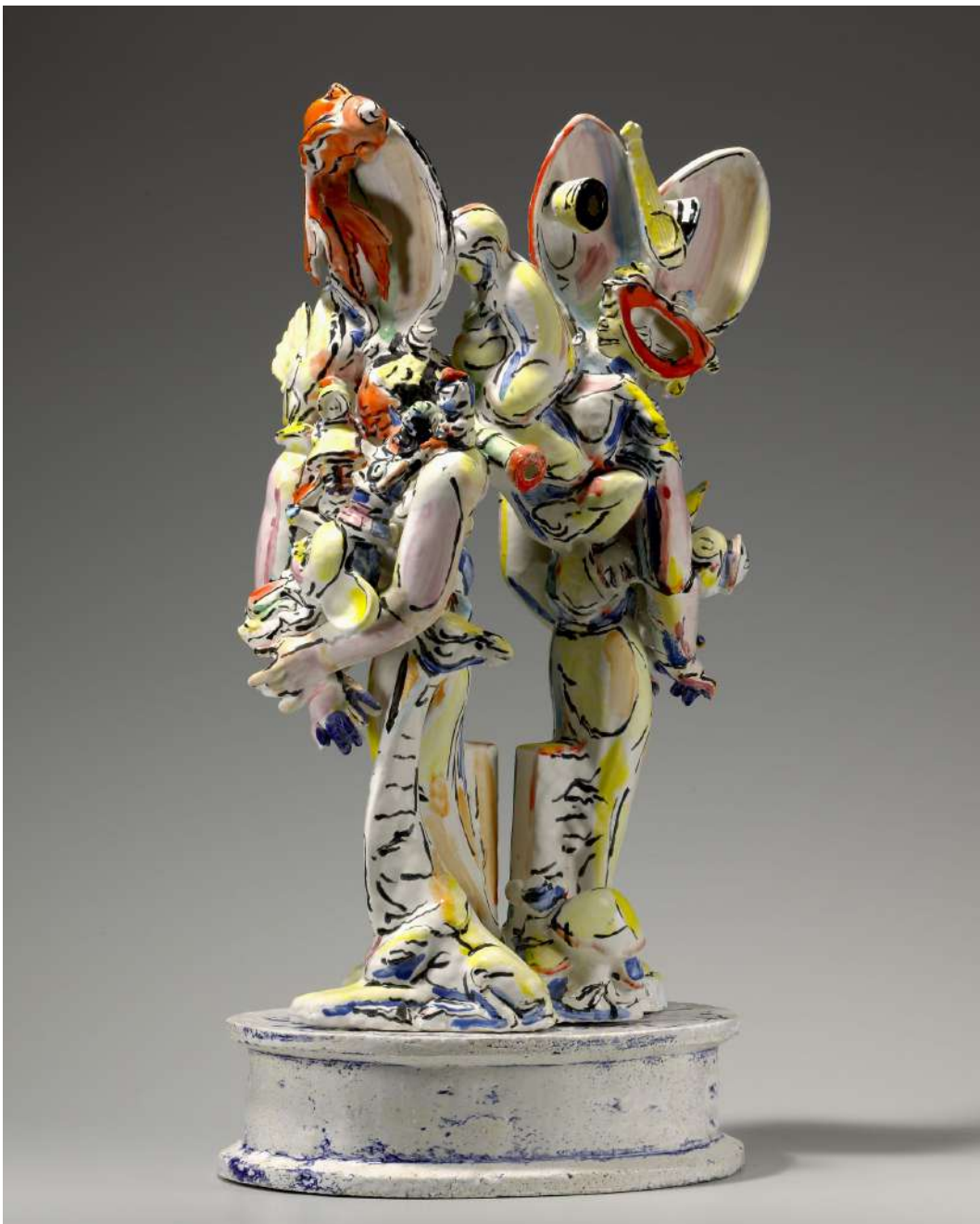
Viola Frey Untitled (Pink Ears and Red Lips Bricolage) , 1984-85 Ceramic and glazes 43 x 22 x 17 in (109.2 x 55.9 x 43.2 cm) VF0011 $65,000