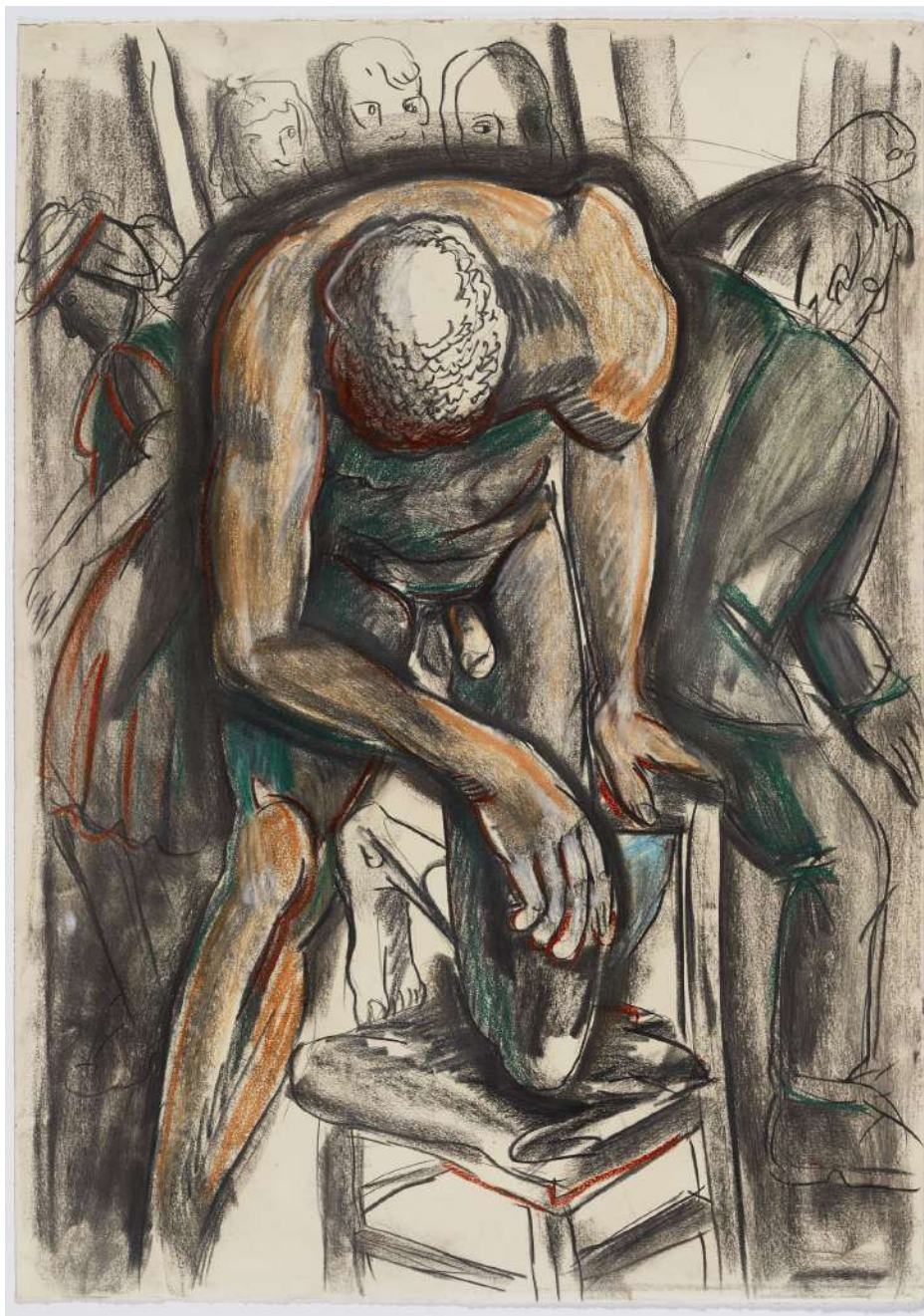
Viola Frey Nude Man with Knee on Chair , 1987-88 Pastel and charcoal on paper 41.5 x 29 in (105.4 x 73.7 cm) VF0021 $30,000