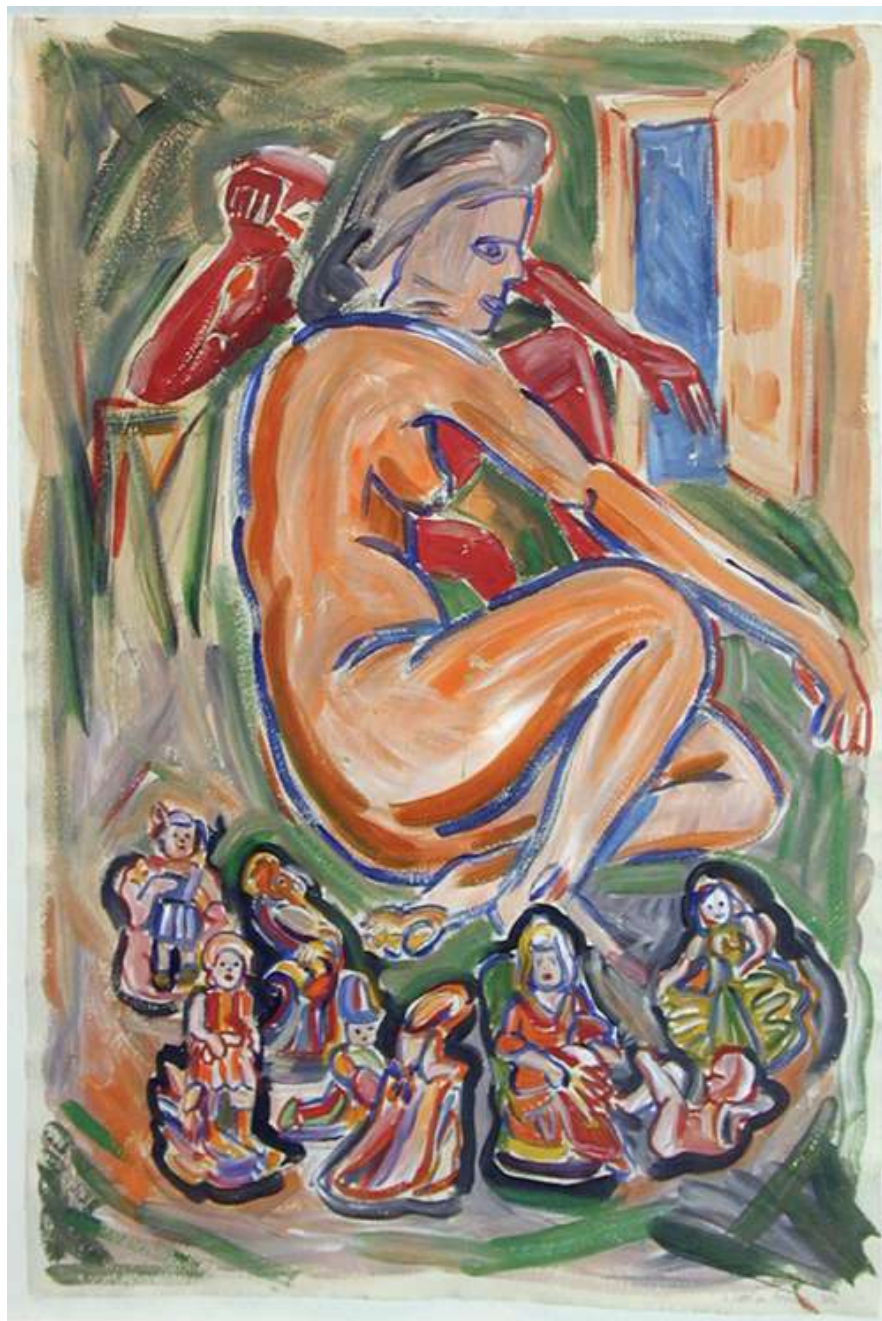
Viola Frey Untitled (Seated Nude and Figurines) , 1985 Acrylic on paper 31 x 22 in (78.7 x 55.9 cm) VF0015 $25,000