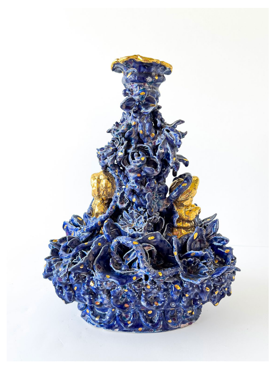
Anthony Sonnenberg Small Blue Candelabra (A Special Treat), 2023 Porcelain over stoneware and found ceramic tchotchkes, glaze, gold luster 13 1/2 x 11 x 12 in 34.3 x 27.9 x 30.5 cm