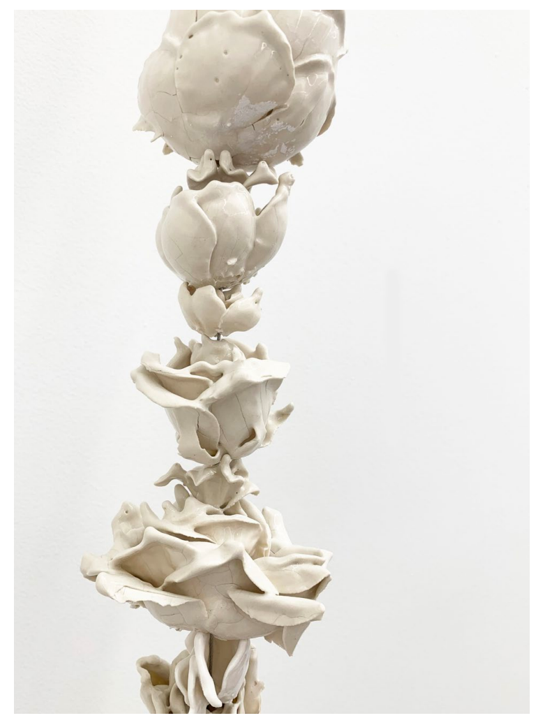
Anthony Sonnenberg Atropes Daisy Chain (for F.G.T.), 2023 Porcelain, glaze, steel, glass 144 x 5 x 5 in 365.76 x 12.7 x 12.7 cm