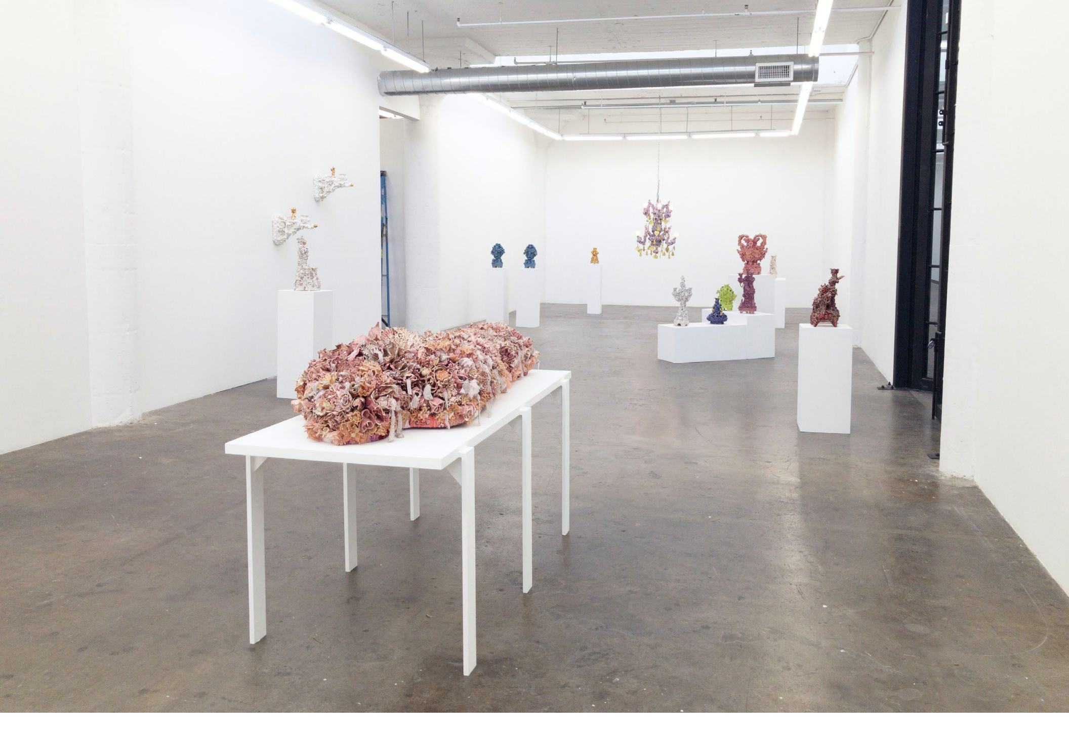
Installation view: Cannons Buried in Flowers , 2023 GAVLAK Los Angeles