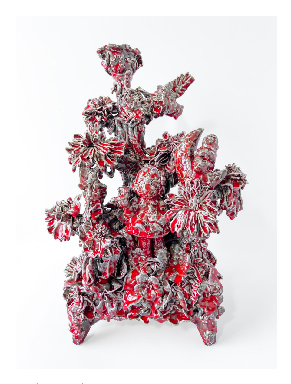
Anthony Sonnenberg Candelabra (To Hell and Back), 2023 Porcelain over stoneware and found ceramic tchotchkes, glaze 17 1/2 x 14 x 8 in 44.5 x 35.6 x 20.3 cm