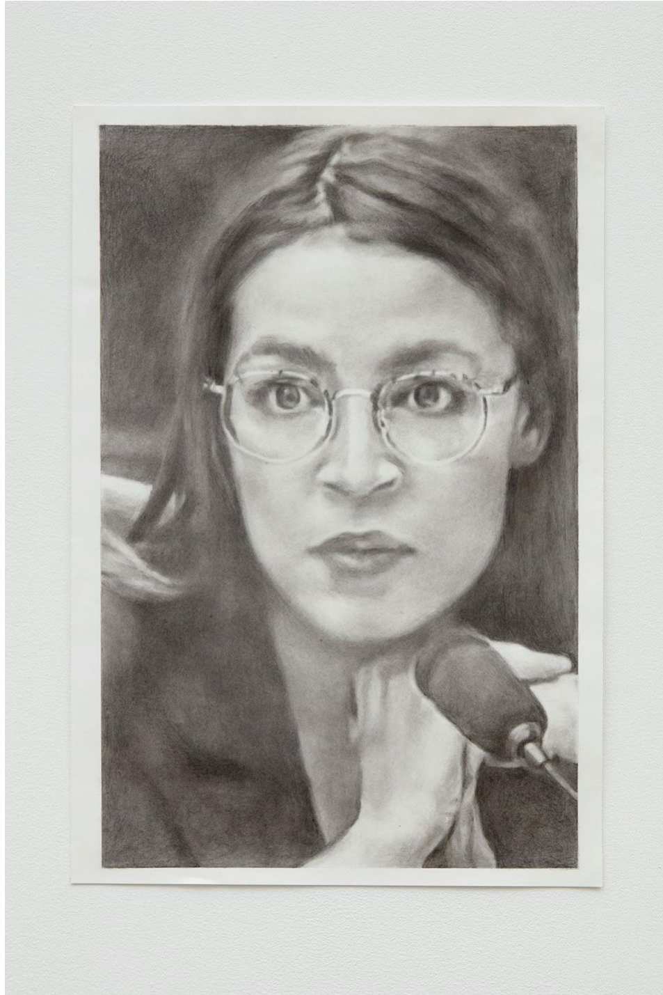
Judith Eisler's AOC (2020)