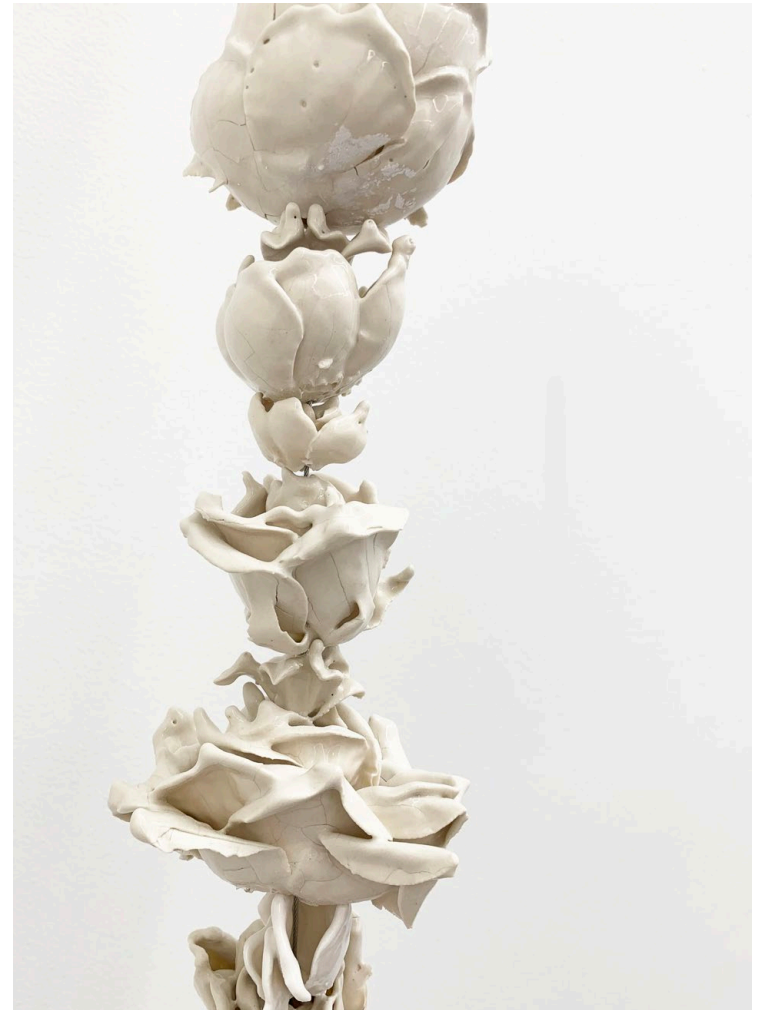
Anthony Sonnenberg Atropes Daisy Chain (for F.G.T.), 2023 Porcelain, glaze, steel, glass 144 x 5 x 5 in 365.76 x 12.7 x 12.7 cm