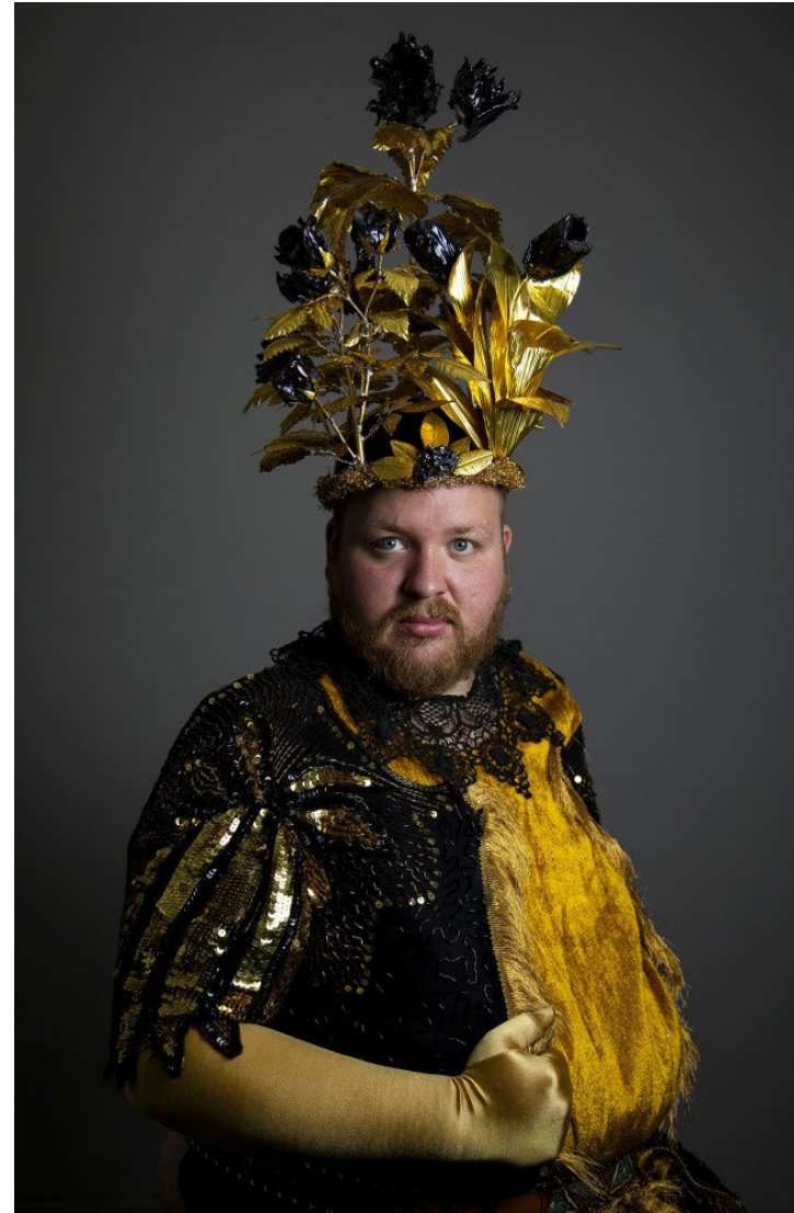
Portrait of the artist Anthony Sonnenberg

Anthony Sonnenberg works reside in the permanent collections of the Crystal Bridges Museum of Art, Bentonville, AR and the Archie Bray Permanent Collection, Helena, MT. Recent solo exhibitions include presentations for the Art Museum of South East Texas, Beaumont, TX (2018); the Lawndale Art Center, Houston, TX (2015); and the Old Jail Art Center, Albany, TX. His work was featured in recent group exhibitions including the Toledo Museum of Art, Toledo, OH (2020); the Fuller Craft Museum, Houston, TX (2019); the Contemporary Arts Museum, Houston, TX (2019); the Institute of Contemporary Art at MeCA, Portland, ME (2017); and the Texas Biennial, Austin, TX (2011).