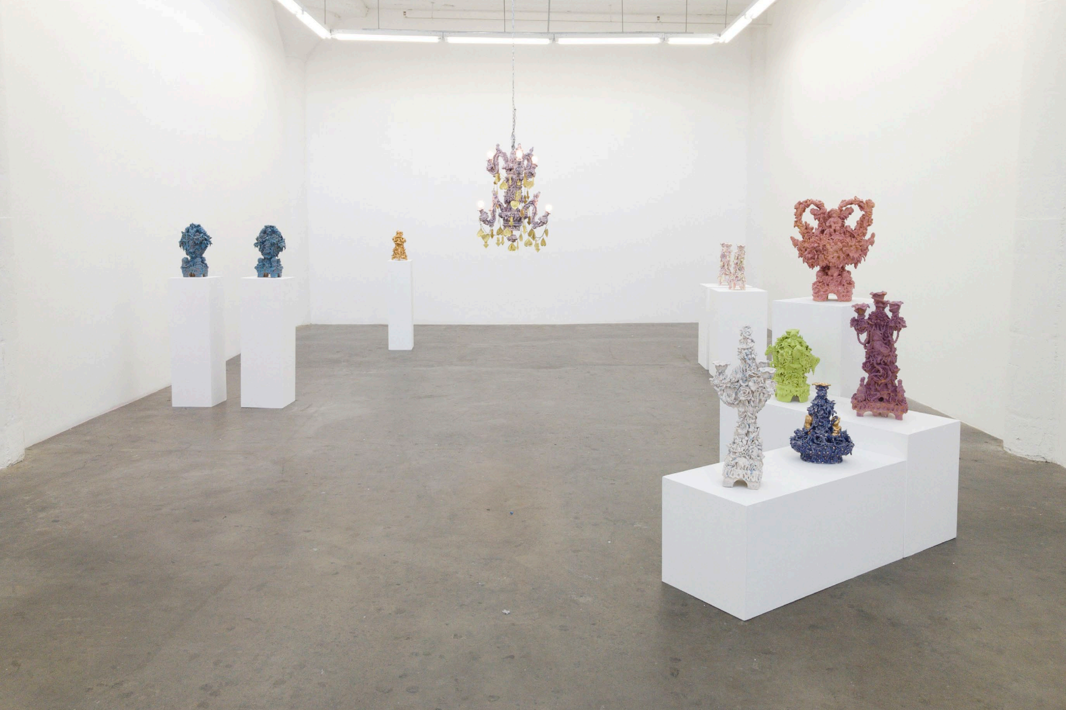
Installation view: Cannons Buried in Flowers , 2023 GAVLAK Los Angeles