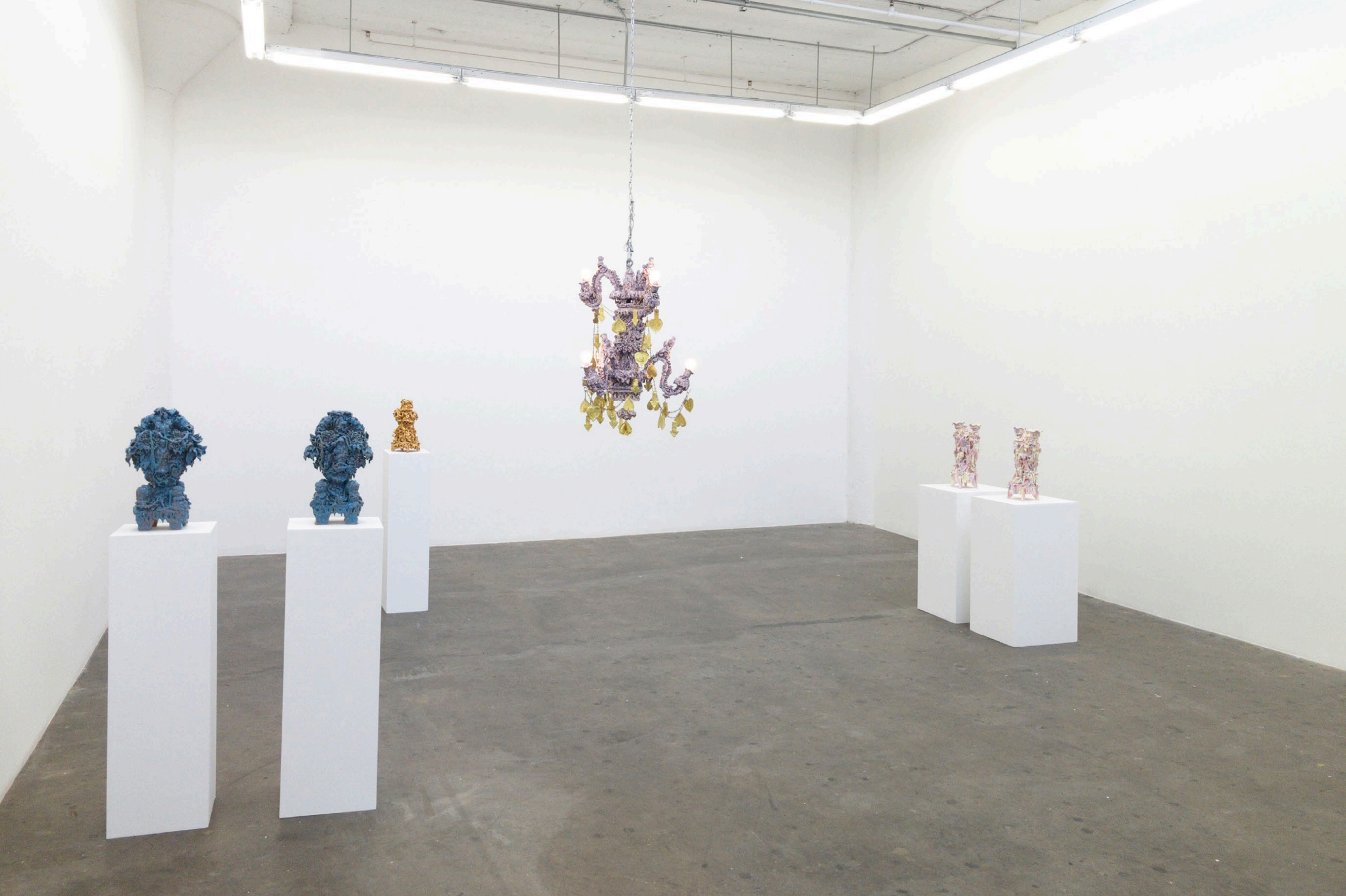
Installation view: Cannons Buried in Flowers , 2023 GAVLAK Los Angeles