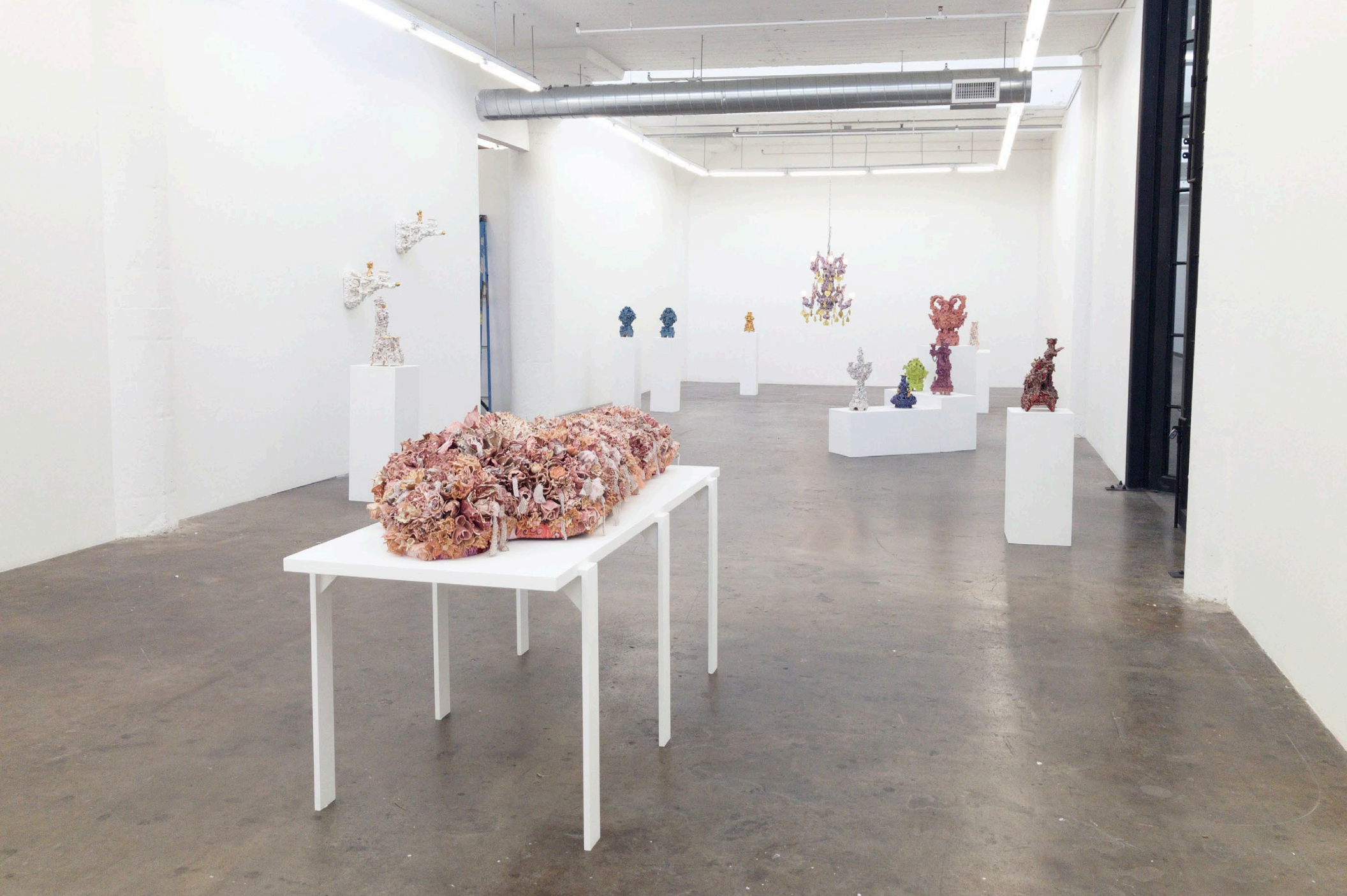
Installation view: Cannons Buried in Flowers , 2023 GAVLAK Los Angeles